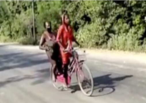
An adolescent girl pedaling her injured father for 7 days to cover the distance of 1200 K.M.

A mother of a two year child collapsed and died at a railway platform during travel to her native. Her innocent tiny child was found to trying to awaken the dead mother under an impression that she was alive and sleeping due to exertion. This real story brought tears in the eyes of many people.