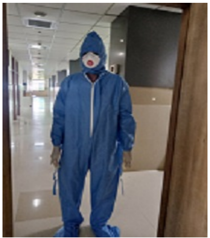
An X- Ray technician civil hospital, Gandhinagar- Gujarat

However, it cannot be claimed that the situation has been fully under control. The researcher will be Failing in his duty if he does not place on record commendable Services rendered by doctors and para medical staff like pharmacists, X-Ray technicians, laboratory technicians, Nurses to combat pandemic.