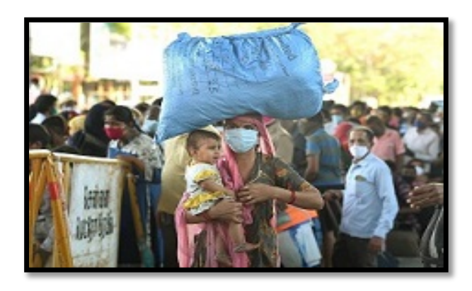
Pitiable plight of Migrant labors –lockdown during pandemic (Gujarat, India)