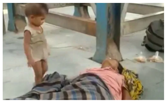
A child waking up her dead mother

A mother of a two year child collapsed and died at a railway platform during travel to her native. Her innocent tiny child was found to trying to awaken the dead mother under an impression that she was alive and sleeping due to exertion. This real story brought tears in the eyes of many people.